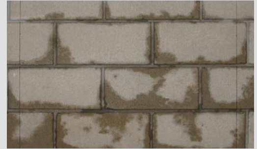
Wall System without RainBloc Technology

*Laboratory tested by the Concrete Masonry & Hardscapes Association using E514 testing methodology.