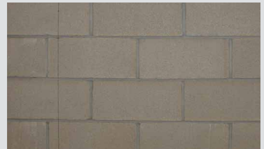
Wall System with Amerimix WRM and CMU's containing RainBloc Technology